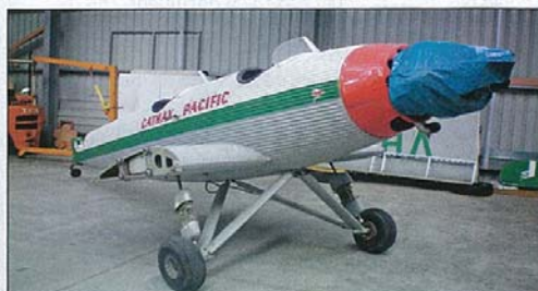
ABOVE Junkers-A 50 c/n 3517 at Dessau during February. It is destined fly with the Classicflug fleet, which already includes a Focke-Wulf Fw 44 Stieglitz and a Waco UPF-7.