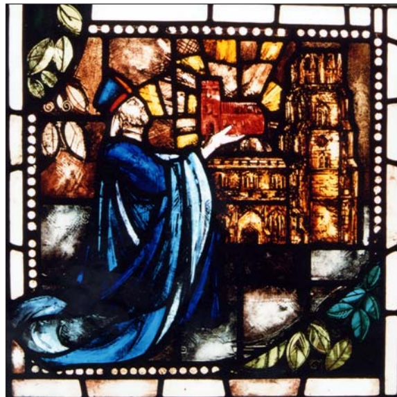
Detail: St. Felix in clerical robes donating an abbey to the people.