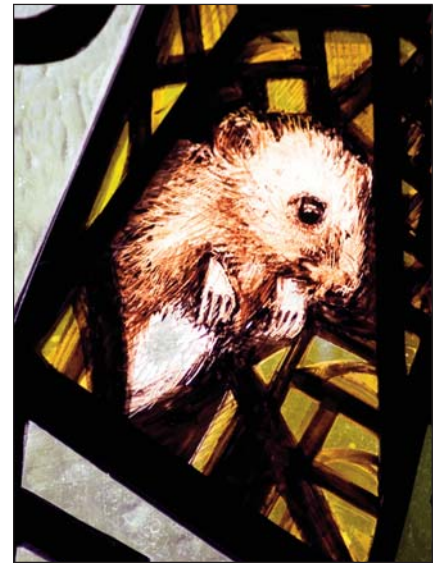
Detail: Harvest Mouse

At the apex of the window can be seen a dove representing the Holy Spirit and at the base of the window can be seen a harvest mouse hidden amongst the bearded wheat.